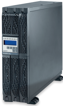
3 101 77