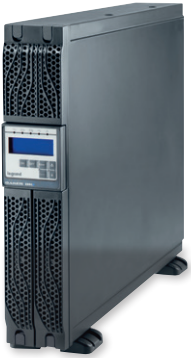
3 101 40