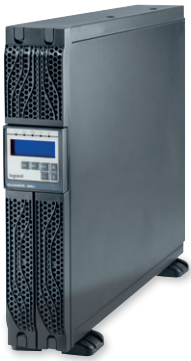
3 101 76