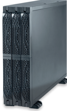
3 106 64

The display shows all the main system parameters and UPS status, including the battery charge level, the remaining autonomy and fault codes. The communication software, which can be downloaded from the internet, not only allows you to control the UPS and shutdown in the event of a user failure, but also offers the possibility of remote testing of the main UPS functions. A dedicated communication slot allows the connection of a WEB/SNMP card for direct interfacing of the UPS to the data network, or of a relay interface capable of providing isolated contacts for applications on industrial panels or remote alarm panels. The automatic bypass, as standard, ensures continuous power supply to the loads in case of electronic failure, overload, overheating or battery replacement. A manual bypass (optional) is also available for scheduled and extraordinary maintenance operations, as it is possible to disconnect and completely remove the UPS while still ensuring power supply to the loads.