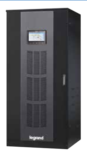
KEOR HPE 100