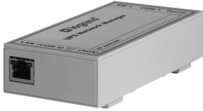
3 108 84

3 108 81 - 3 108 82 - 3 108 83 - 3 108 84 - 3 109 06 - 3 109 07