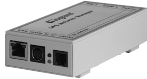
3 109 06