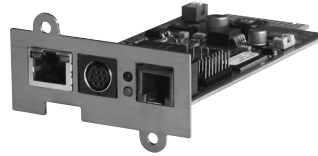
3 109 07